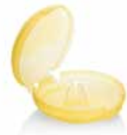
Contact Nipple Shields

Contact Nipple Shields allow you to continue to breastfeed in spite of difficulties, as they protect the breast whilst the baby feeds and provide the baby with something to latch onto, in the case of flat or inverted nipples. The open section of the Contact Nipple Shield allows maximum skin contact between you and your baby.