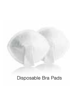
Disposable Bra Pads