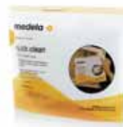
Quick Clean™ Microwave Bag